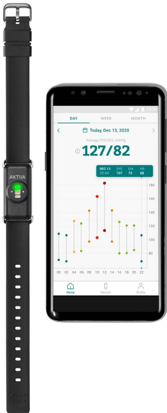
Aktiia Bracelet and the associated smartphone application to visualize SBP and DBP. DBP, diastolic blood pressure; SBP, systolic blood pressure.

[8] protocol to which we added additional aspects to address device-specific challenges. Indeed, we retained the measurement conditions and the nature of the reference measurements, the number of patients, the total number of measurements, the study population stratification, the data analysis and the pass/fail criteria of ISO81060-2:2013, on top of which we added multiple assessments over a period of 1 month to address the