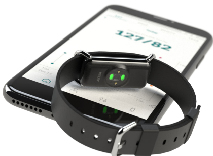
The Aktiia Bracelet + App

Since this initial pilot trial, Aktiia has further implemented this protocol in a pivotal trial ( NCT04027777 ) across a larger, more diverse subject population. Pending FDA clearance and CE mark, Aktiia's product will become the first automated cuffless solution able to measure accurately in the background of daily life without hassle, regardless of body position.